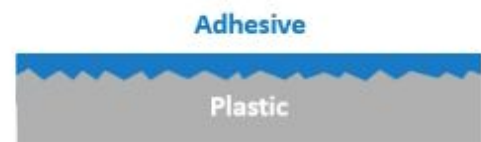
Adhesive wets out surface Good Bond