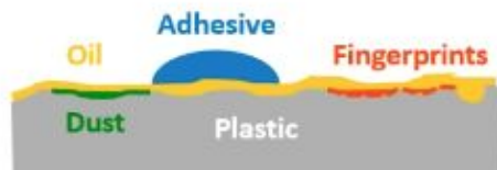
Adhesive does not contact surface Poor Bond

Next, hand sand the cleaned repair area with a course sandpaper (40 Grit) to remove the top micro-layer of the HDPE surface where hydrocarbon penetration may cause some surface corrosion, and to roughen the surface to provide some mechanical lock/adhesion. Afterwards, a final cleaning with acetone or isopropyl alcohol to remove loose materials, contaminant residue, and humidity moisture accumulation is required.